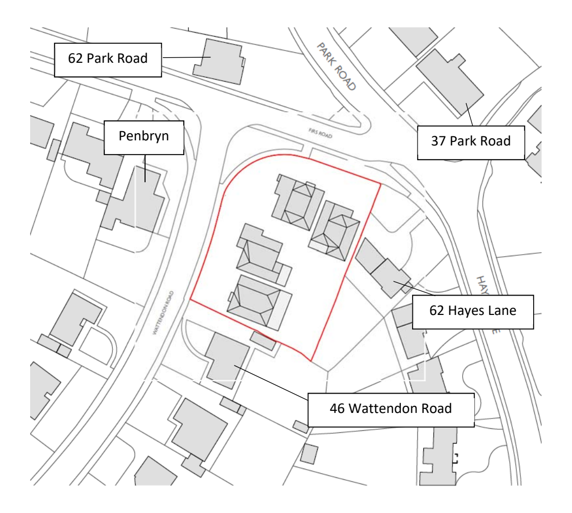
Figure 7-Neighbouring Properties