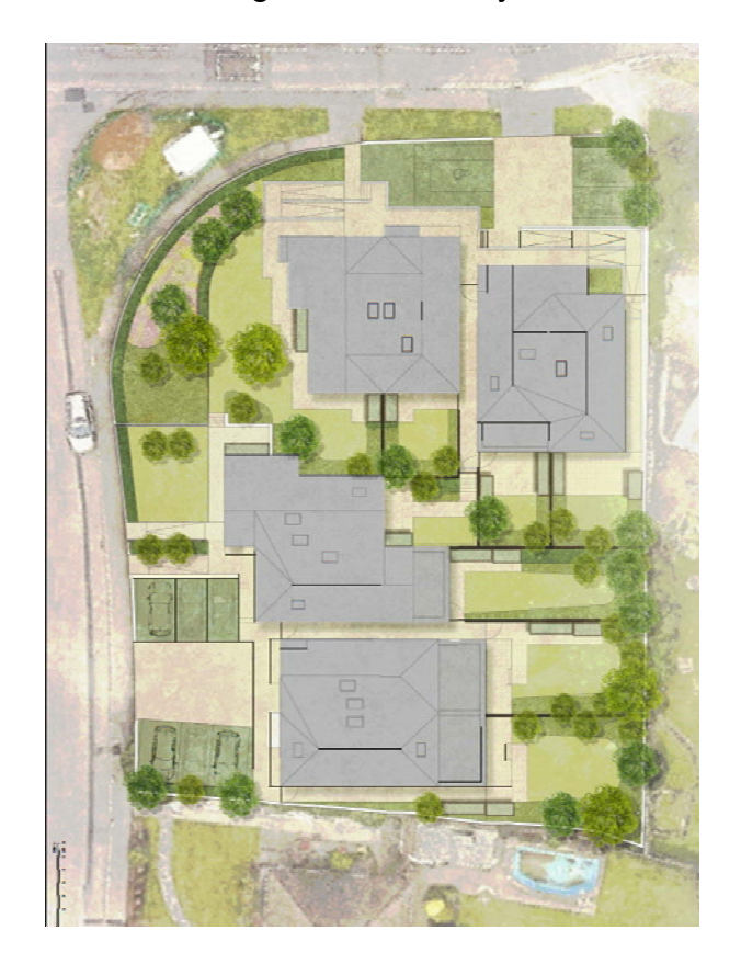
Figure 7-Proposed Landscaping Plan

proposals would positively contribute to the suburban character of the surrounding area. Overall, the proposed landscaping proposals are considered to provide a development that softens then proposed hardstanding to the rear of the site whilst also enhancing the biodiversity of the site.