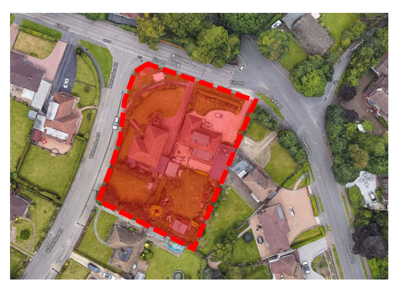
Figure 2-Aerial view of site