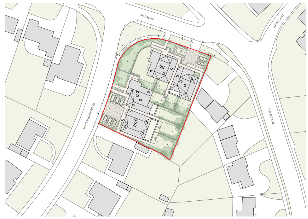
Figure 4-Proposed Site Plan

8.10 Policy DM10.1 seeks to achieve at least 3 storeys within new developments. The proposed development would use an asymmetrical design with bedrooms located in roof spaces, accommodating this policy requirement whilst also minimising the overall heights and eaves heights of the buildings to respect those of the adjacent buildings. This design approach would ensure that these are not read as typical semi-detached properties (which are typically symmetrical in style) but instead read as four detached, asymmetrical buildings which sit well within the street scene.