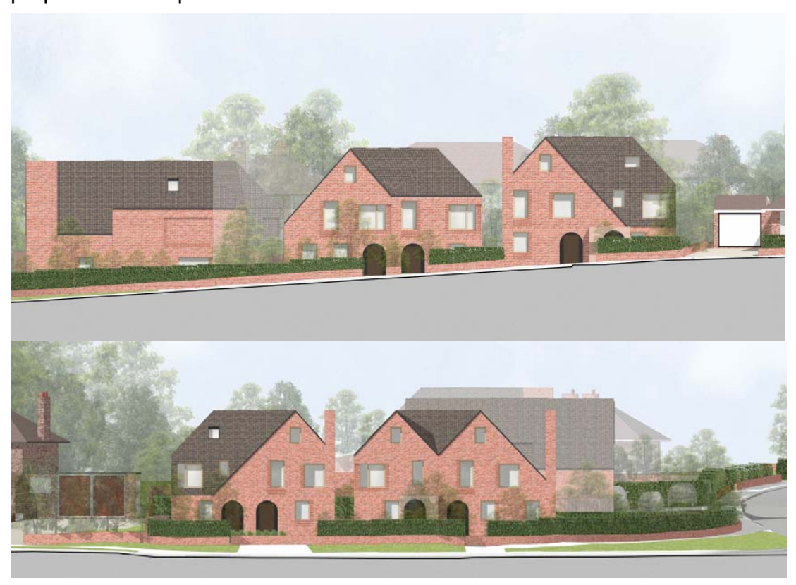
Figure 6-Proposed Elevations (Firs Road/Wattendon Road)

8.17 Clay hung pantiles are proposed for the roof and provide a clear distinction between the red brick and darker clay tiles which breaks up the façade of the building further. Metal frame windows are also proposed which are considered to be of a high quality which would contribute to the quality of the design of the proposed development.